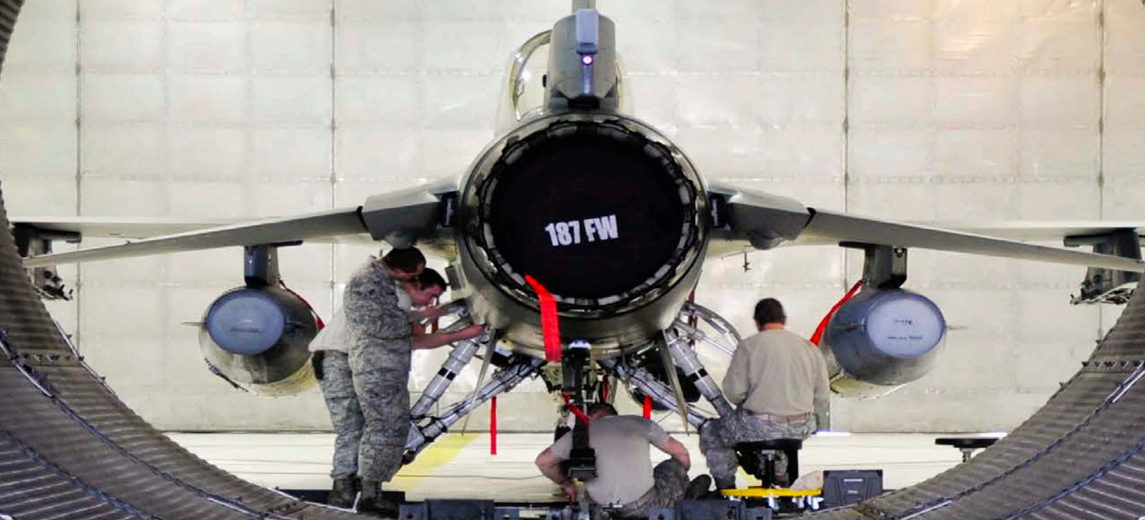
Alabama Air National Guard members replacing panels on an F-16 Fighting Falcon located in the Hush House after a successful engine test, Mar. 11, 2014.