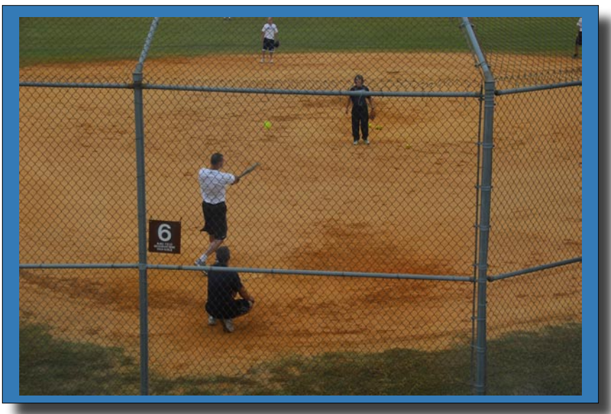
MAXWELL AFB, Ala - Members of the 187 Fighter Wing play baseball during the Safety Morale Day on Sun., April 15, 2012. See more photos at page 10.

ON THE COVER >> May is Asian-Pacific American Heritage Month. It was originally introduced as Pacific/Asian Heritage Week in 1977. This year's theme is "Leadership, Diversity, Empowerment, and Beyond." For more information, visit the Asian Pacific American Heritage Month website.