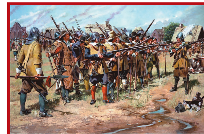
The First Muster in spring 1637; this took place after the December 13, 1636 Massachusetts General Court declaration established three regiments within the colony to defend against enemy attack and preserve settlements, established in the English militia tradition.